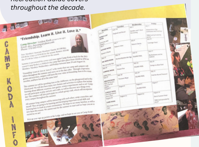
Pictured above: Camp Koda was a kids day camp that was run in ALCA for many years.