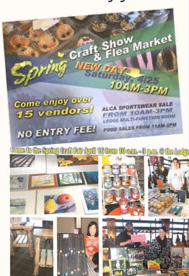
Pictured above: Spring craft fairs from this decade.